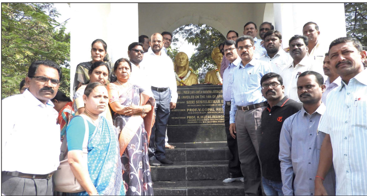
Jyothi Rao Phule Jayanthi