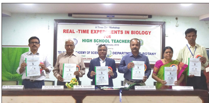
Workshop of Botany