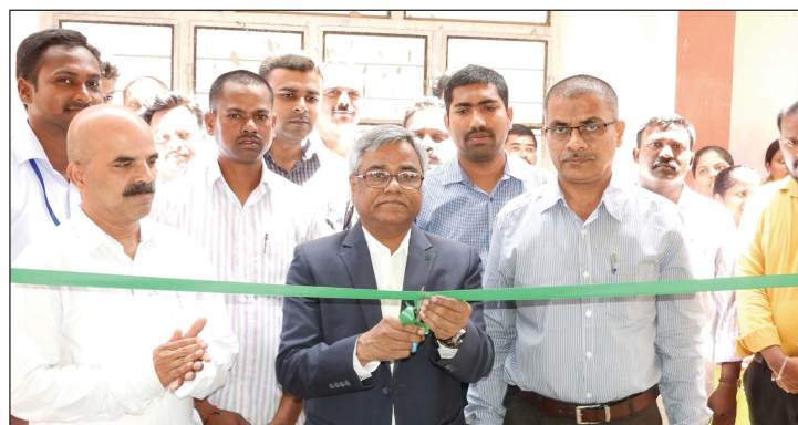
Inauguration of Engineering Labs