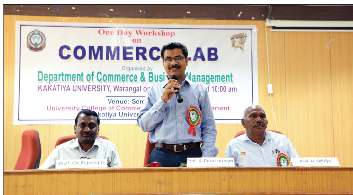
Workshop on Commerce Lab