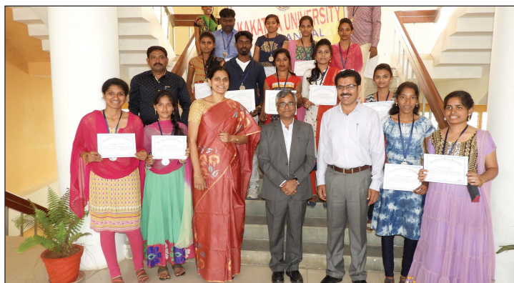
NSS Volunteers Award Winning Team