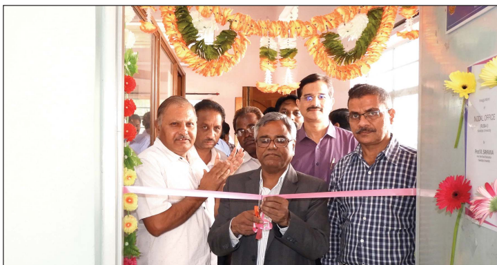
Inauguration of RUSA Office