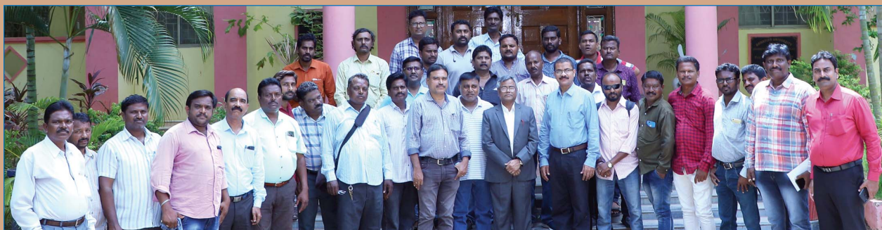
Print & Electronic Mediapersons with Vice-Chancellor and Registrar