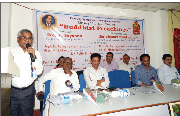
Talk on Buddhist Preachings