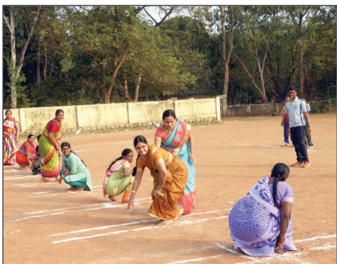
Games & Sports to Employees