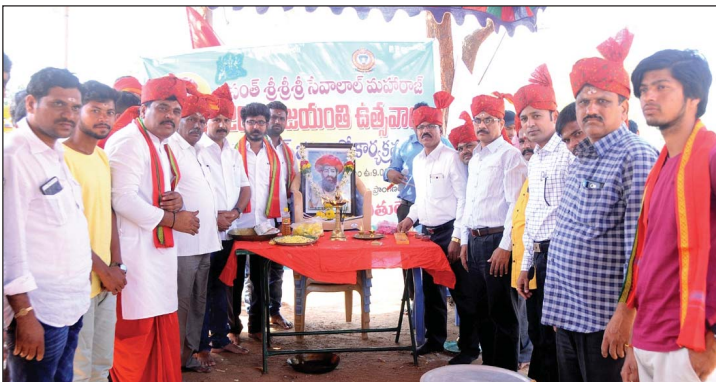
Sant Sevalal Maharaj Jayanthi