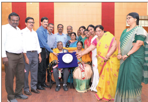
Association of Kakatiya University Teachers (AKUT)