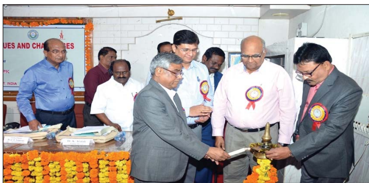
National Seminar in Sociology & Social Work