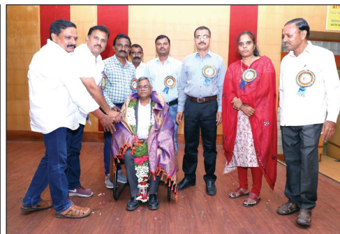
Non-Gazetted Officers Association