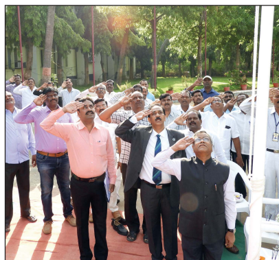
Telangana State Formation Day Celebrations