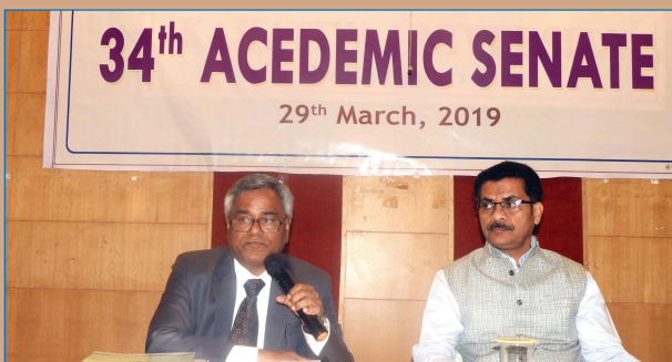
34th Academic Senate