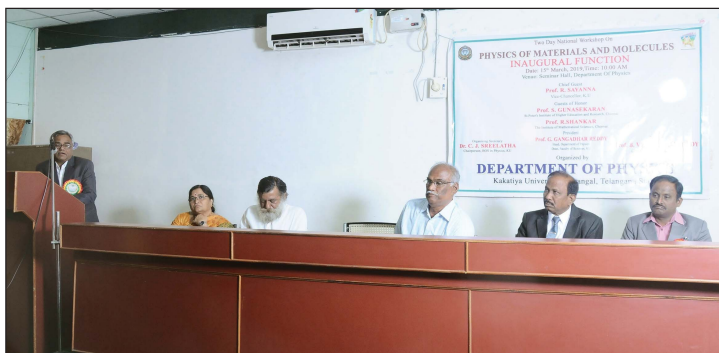
Workshop in Physics