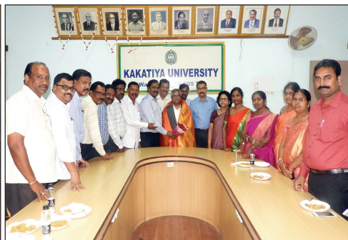
Administrative Officers Association