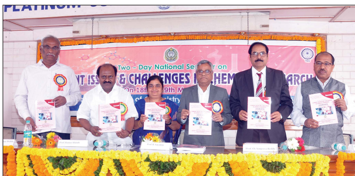
National Seminar in Chemistry