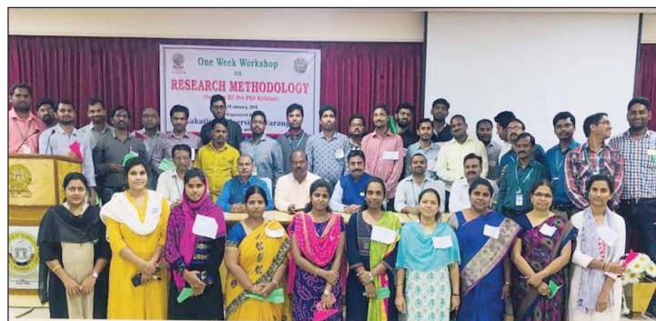
Workshop in Engineering & Technology