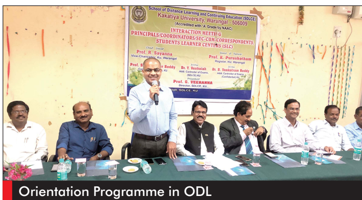
Orientation Programme in ODL