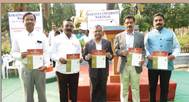
Editorial Board of the KU Newsletter