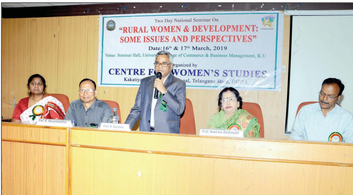
National Seminar on Rural Women & Development