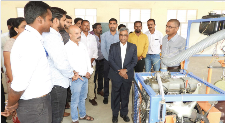
Technical Training at the University Engineering College