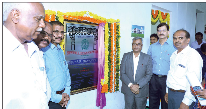
Inauguration of First Floor at Dept. of Geology