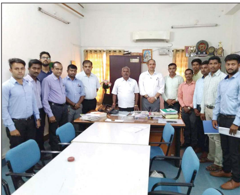
Commerce & Business Management Students