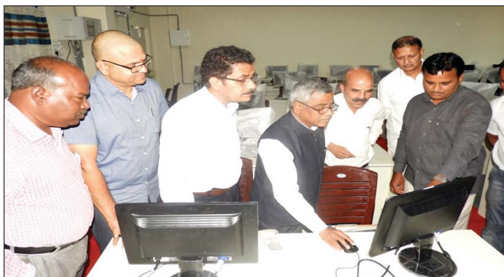
Launching of University Engineering College Website