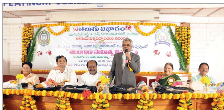
National Seminar of Telugu