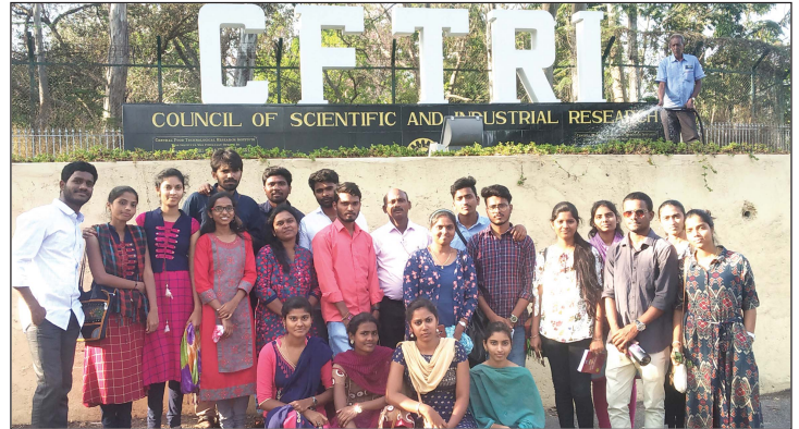
Students Training programme at the CFTRI, Mysore