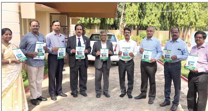
Release of New UG/PG Brochure of SDLCE