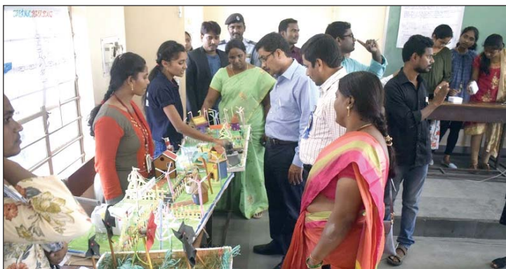
Engineering College (Women) Students at Rubyzest 2019