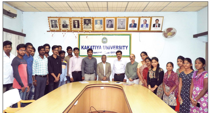
University Engineering College (Co-education) Students