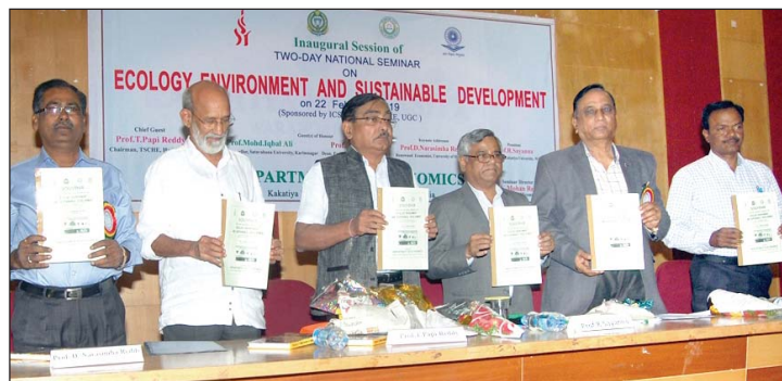
National Seminar on Ecology