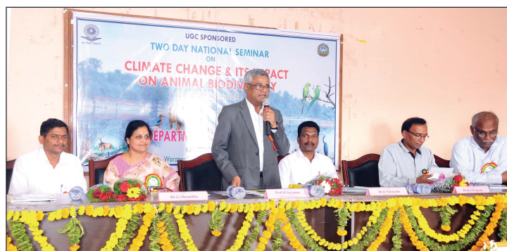
National Seminar in Zoology