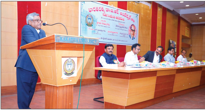
Dr. B.R. Ambedkar Jayanthi