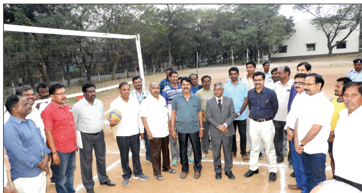
Games & Sports to Employees