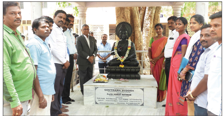
Buddha Purnima Day Celebrations