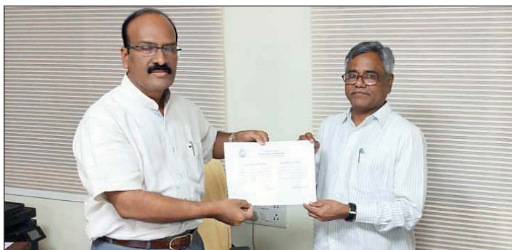
Handing over the charge