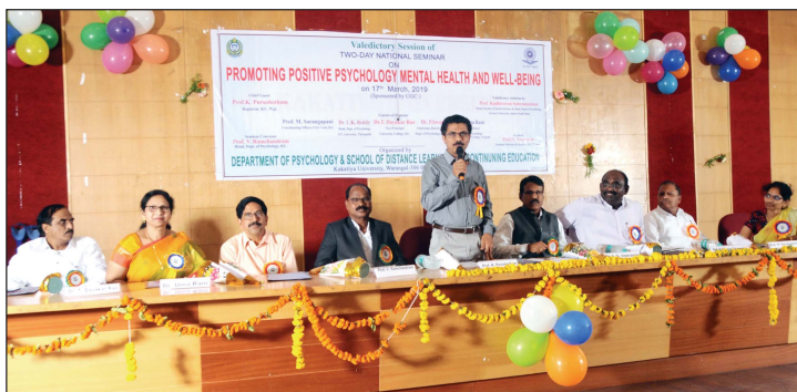
National Seminar in Psychology