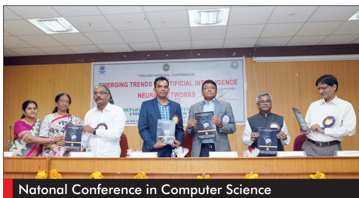
National Conference in Computer Science