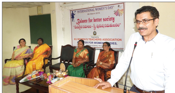
International Women's Day Celebrations