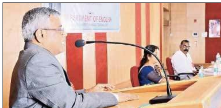
National Seminar in English