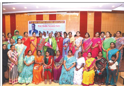
KU Women Employees