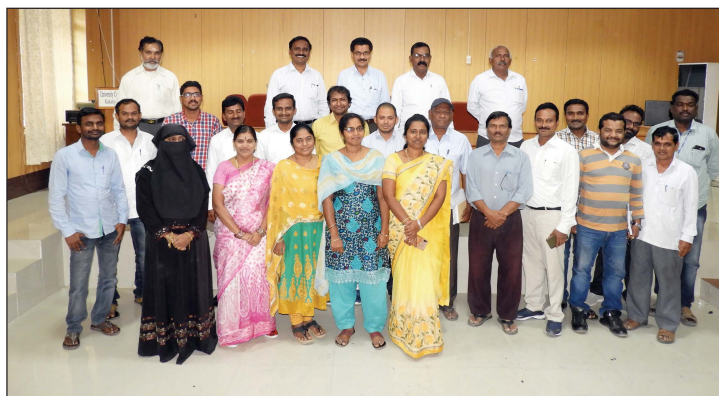
Training for Non-Teaching Staff