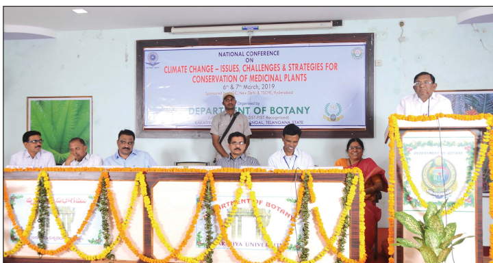
National Seminar on Climate Change