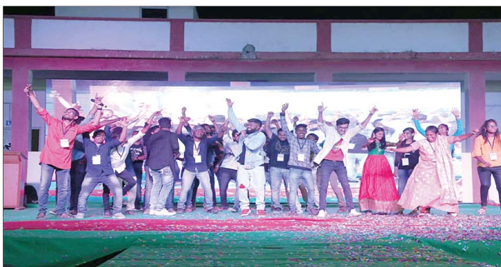
Engineering Students at Kleio-Tech 2019