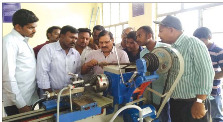
Workshop for Engineering Lab Staff