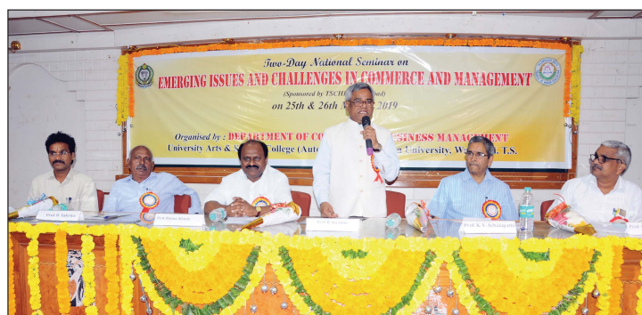
National Seminar on Challenges in Commerce