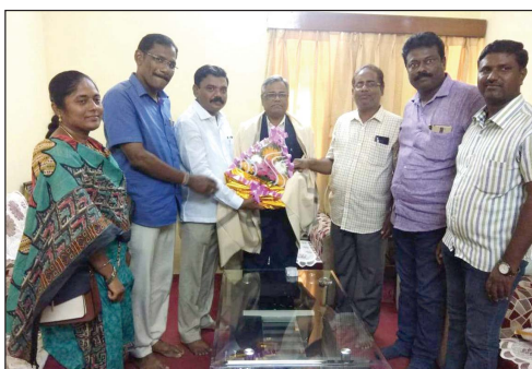
KU Technical Staff Association