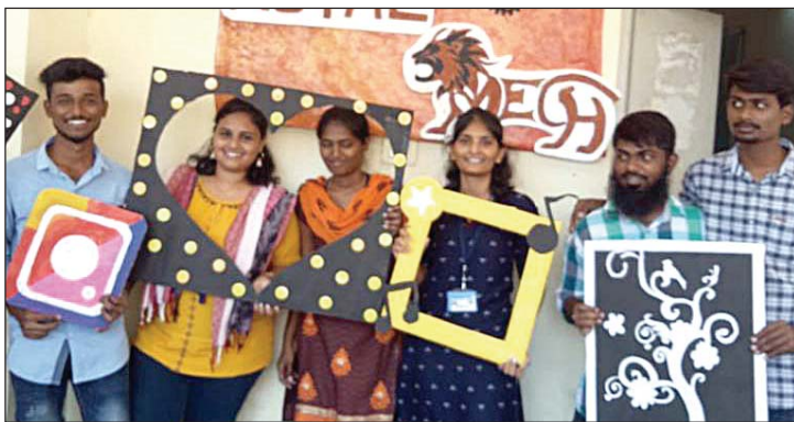
Engineering College Students Festival - Kleio-Tech 2019