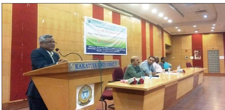
Talk on Power Generation