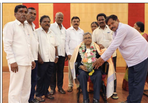
Class-IV Employees Association