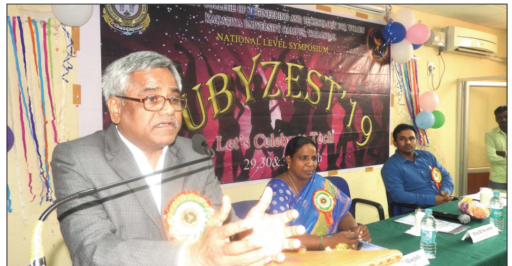
Engineering Students Festival - Rubyzest'19