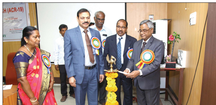
Lightning the Lamp at National Seminar of Chemistry