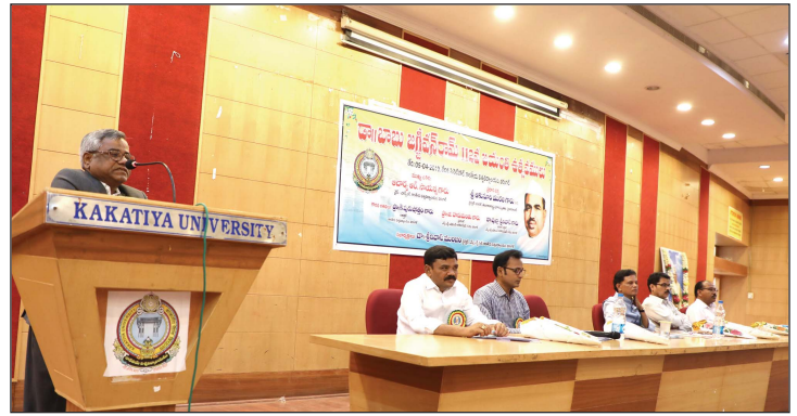
Dr. Babu Jagjeevan Ram Jayanthi