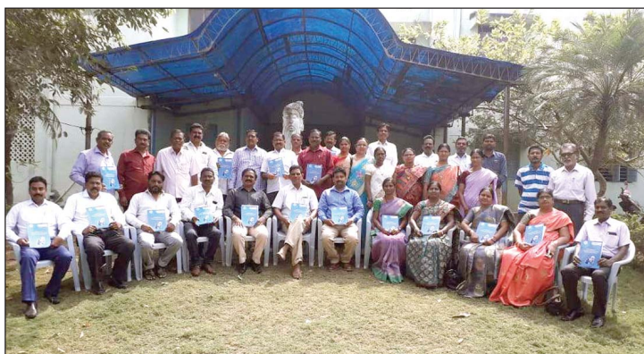
Non-Teaching Staff deputed for Training