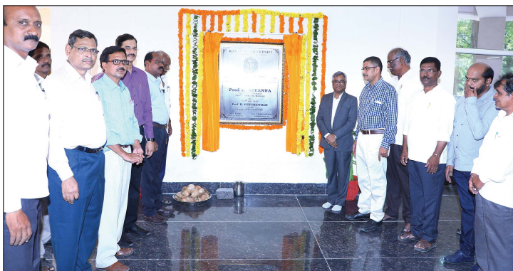
Inauguration of New Hostel Building