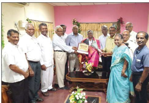
KU Retired Teachers Association