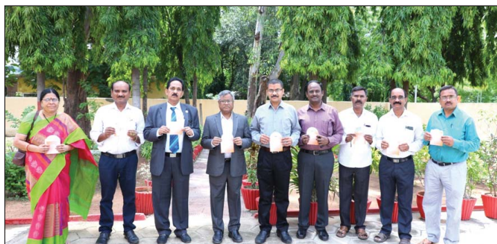
UG/PG Examination Results

The MSc Geology (Final) students had undergone training on "Applications of Remote sensing and GIS" from June 20-26, 2019 in the prestigious Geological Survey of India, Training Institute, Hyderabad.