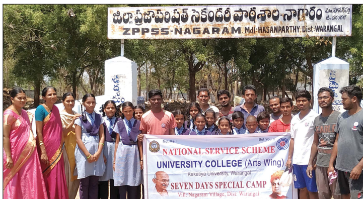
NSS Camp at Nagaram School