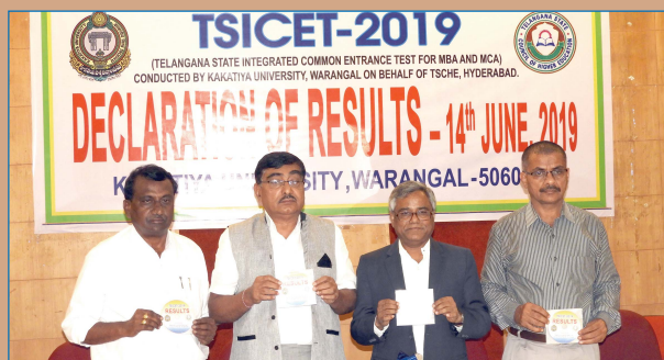
TSICET-2019 Declaration of Results