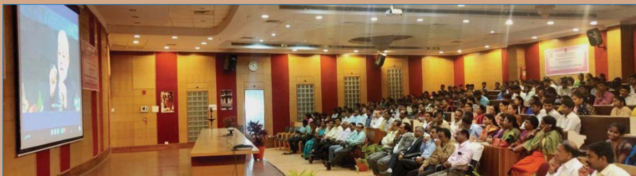
Faculty, Scholars and Students at the Video Conference of Hon'ble Prime Minister Sri Narendra Modi on RUSA